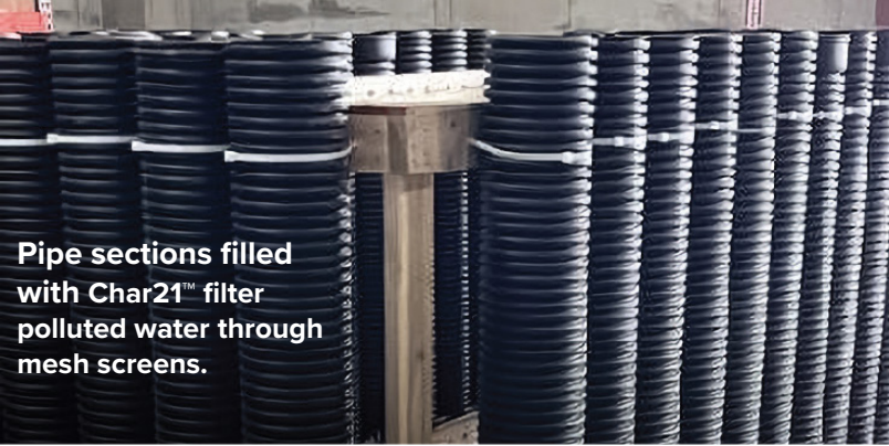
Pipe sections filled with Char21™ filter polluted water through mesh screens.