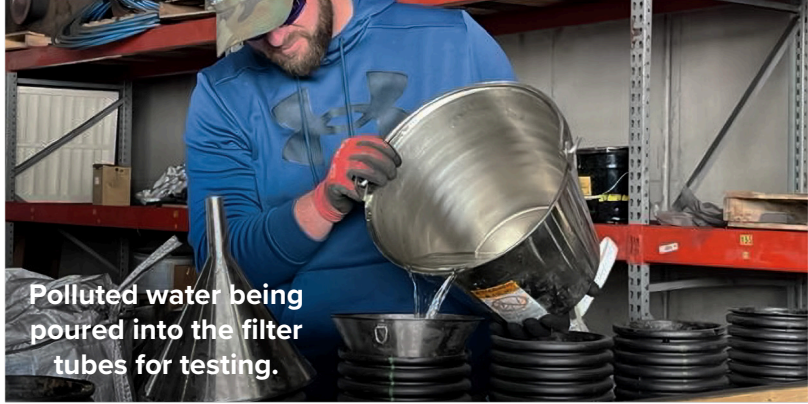
Polluted water being poured into the filter tubes for testing.