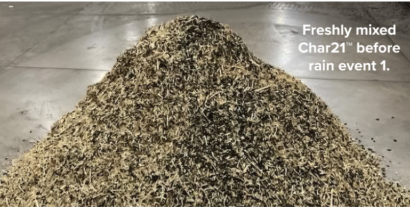
Freshly mixed Char21™ before rain event 1.